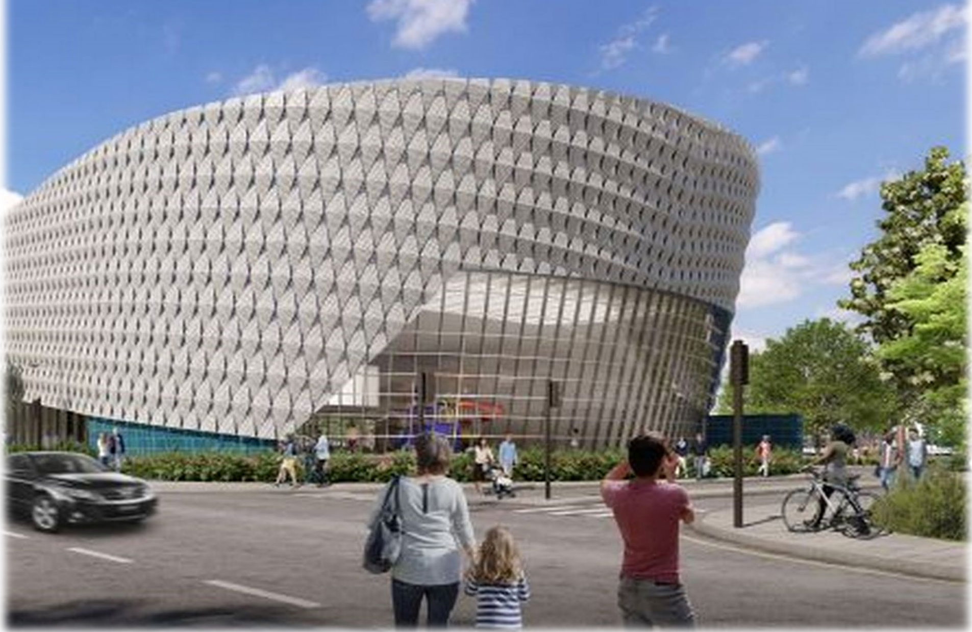
Leisure and Wellbeing Centre